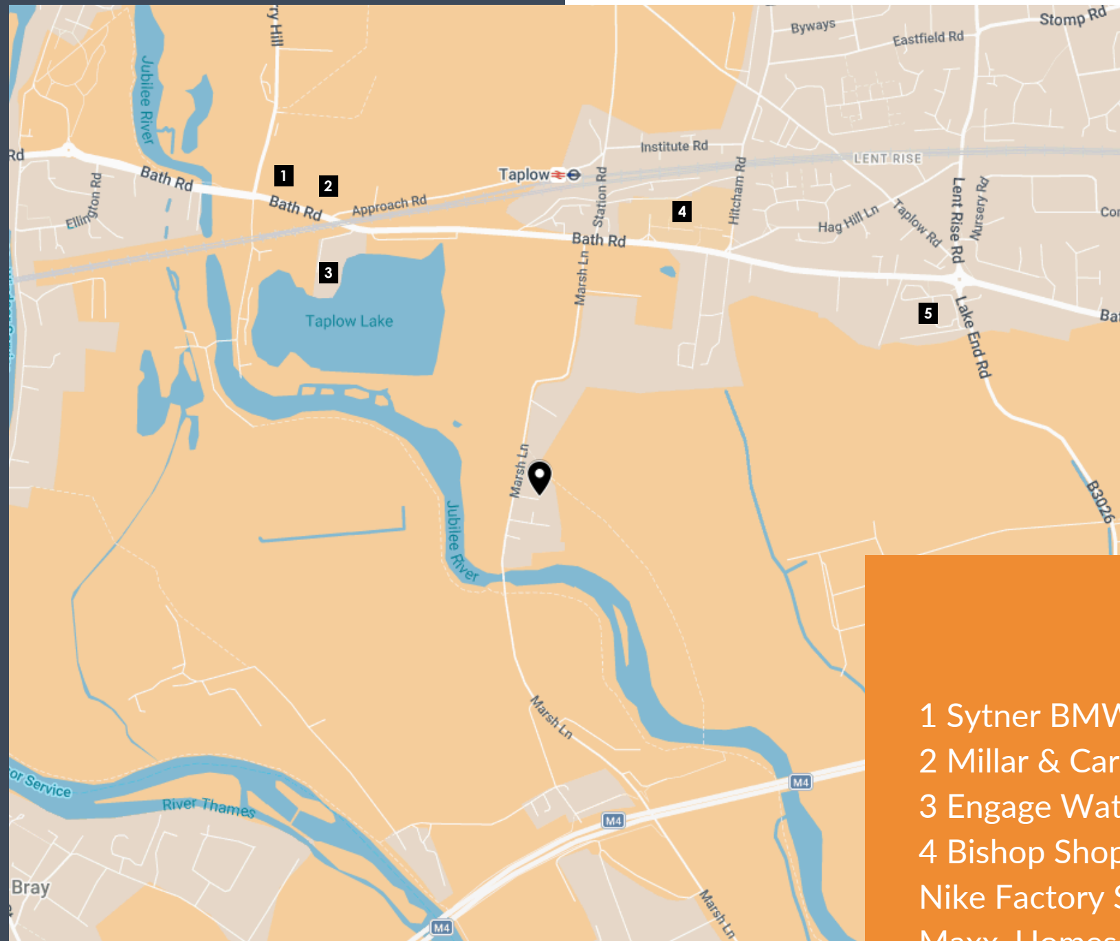
Map Data: Google My Maps