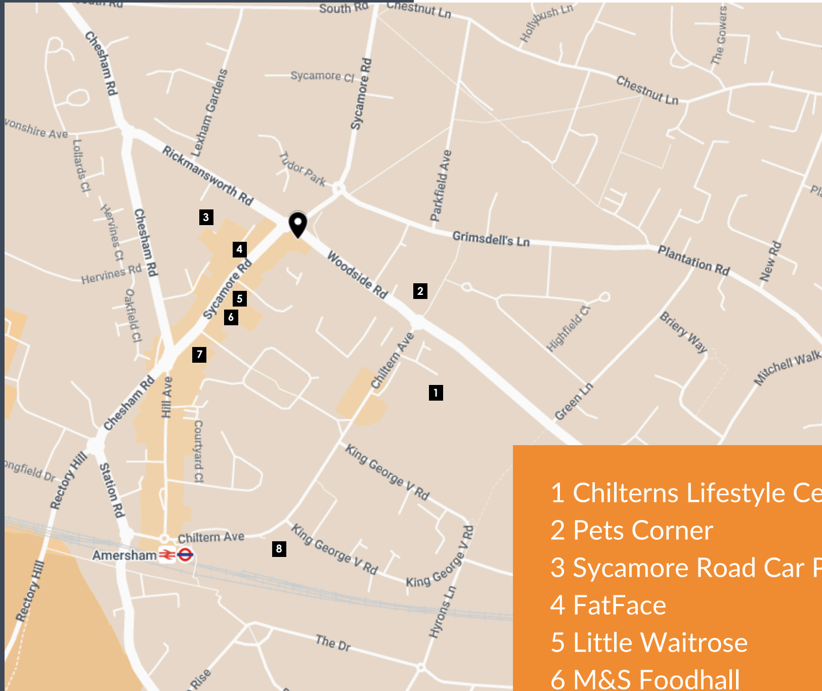
Map Data: Google My Maps